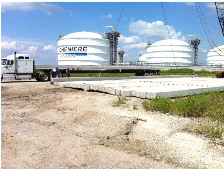
Concrete pile unloading to lay down 21-Aug-2012