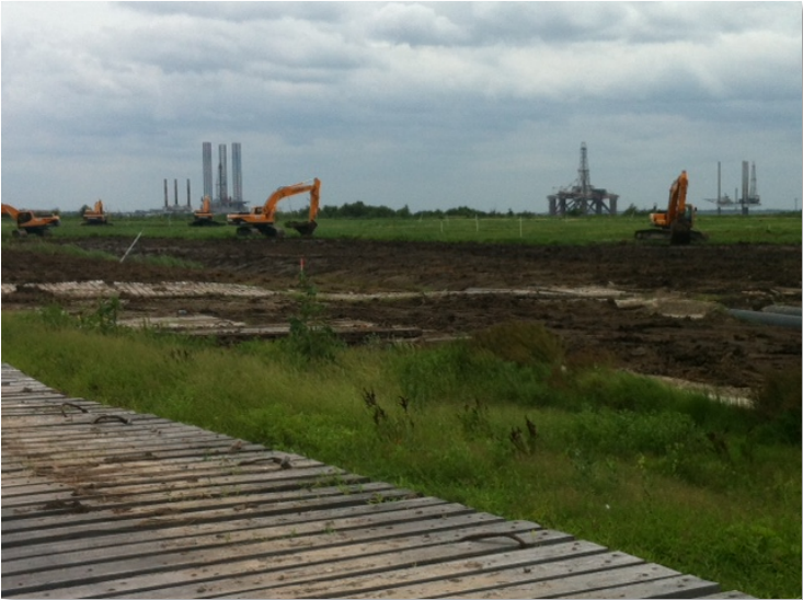
Stripping and grubbing in Train 1 ISBL Area. 29-Aug-2012