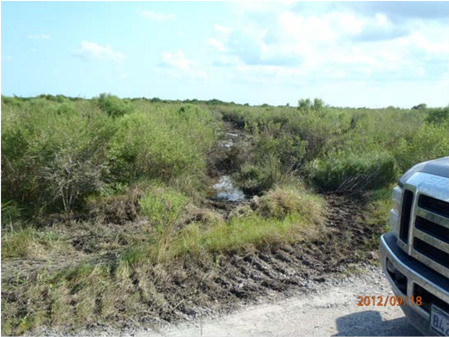
Area on Heavy Haul Rd where dozer went out of the workspace, facing south (18-Sep-2012)