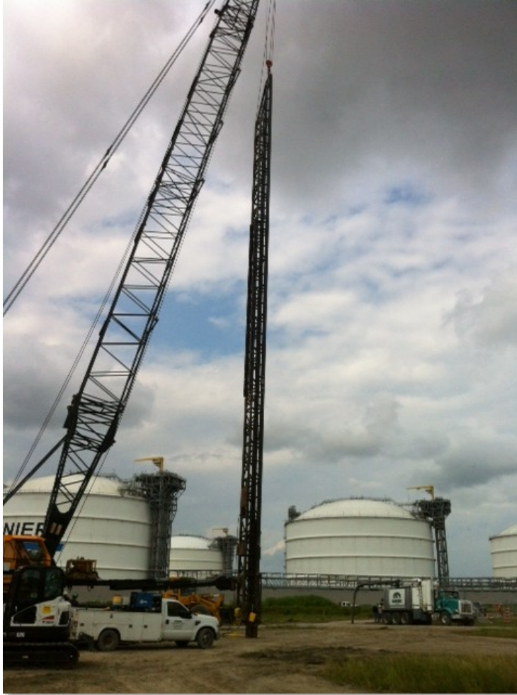
Pile driver setup 22-Aug-2012