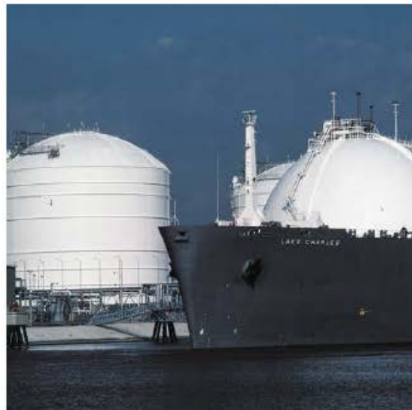
The liquefied natural gas storage tanks at the existing Lake Charles LNG facility.

At the close of the comment period, we will consider all comments received on the draft EIS, prepare written responses to those comments, and revise the draft EIS, as necessary, to create the final EIS. The final EIS will also be mailed to the environmental mailing list. The Commission will consider the findings in the final EIS, along with other non-environmental information, when it makes its decision about whether or not to approve the project.