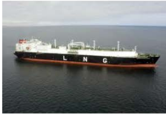
A liquefied natural gas tanker ship in transit at sea.