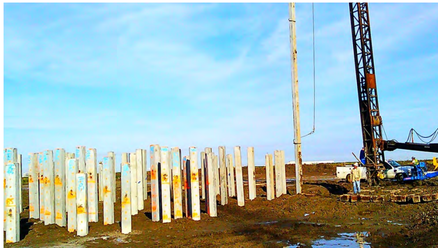
Pile Driving, Area 131N (14-Jan-2013)