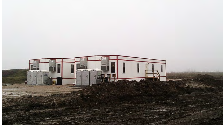
Bechtel Temporary Facilities (14-Jan-2013)