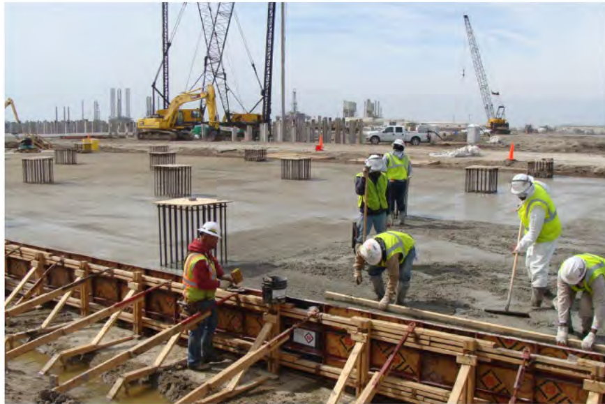
Finishing the Pour, 131N (14-Feb-2013)