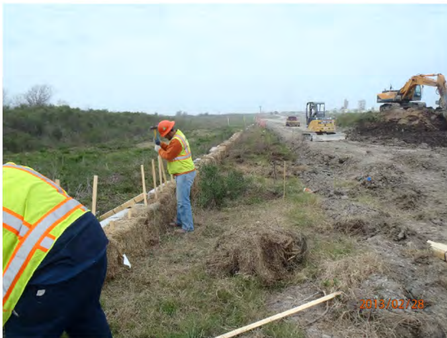
Reinforced hay bales installed along Heavy Haul Road (28-Feb-2013)