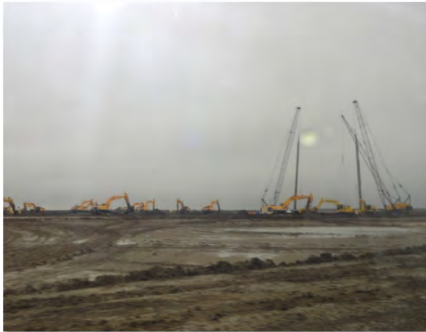
Train 1 / Train 2 Mixing (27-Nov-2012)