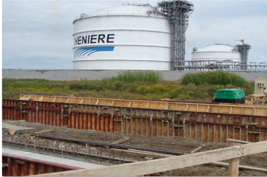
Heavy Haul Road Pipeline Bridge Crossing (18-Oct-2012)