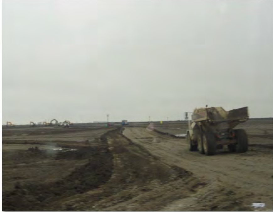
Heavy Hall Road (27-Nov-2012)