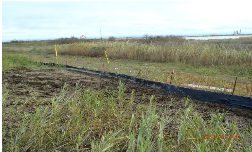
Silt fence installation between the Ro-Ro and the pipeline bridges (14-Jan-2013)