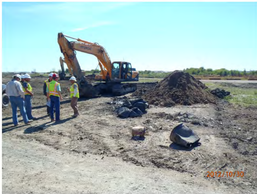
Waste drums uncovered during soil prep (30-Oct-2012)