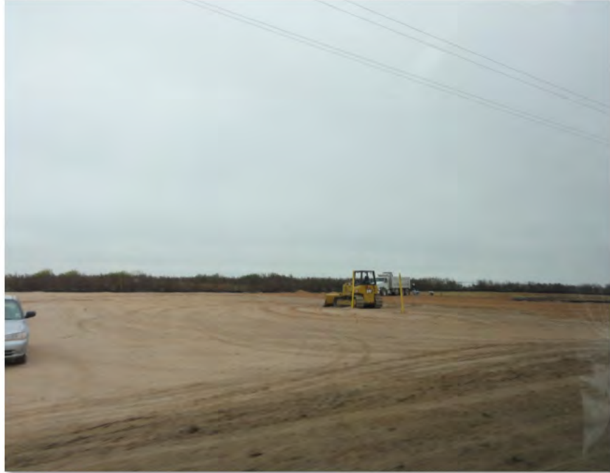
Parking Lot (27-Nov-2012)