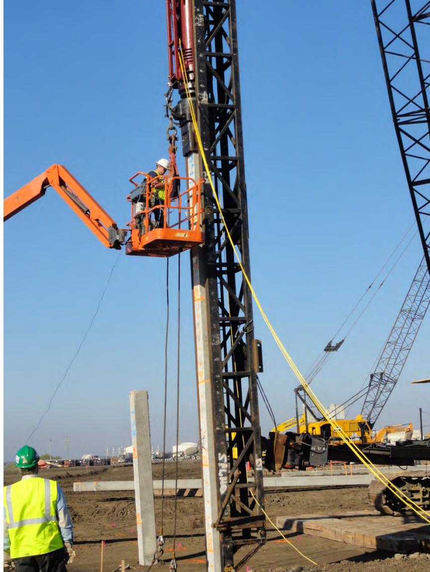
Pile Drive Analyzer (28-Nov-2012)