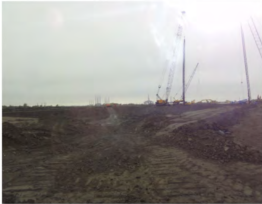
Train 1 Bathtub (27-Nov-2012)