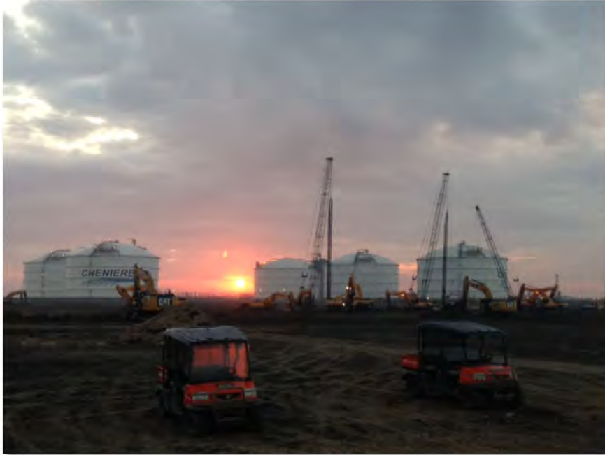
Piling Progress in Area N (21-Dec-2012)