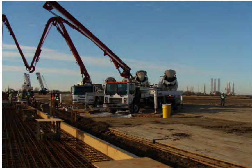
Concrete Pump Trucks (14-Feb-2013)