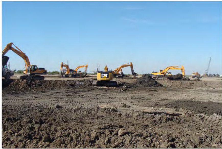
Recon Excavators Improving Soil (30-Oct-2012)