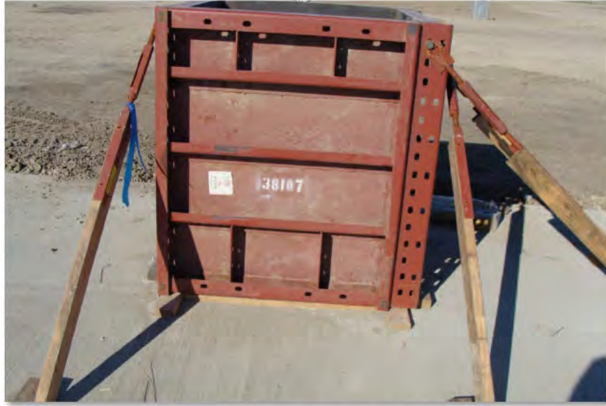
Pedestal Formwork (14-Feb-2013)