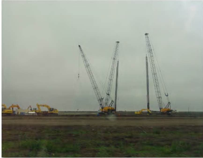
BoMac Piling Rigs (27-Nov-2012)