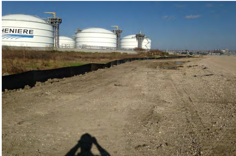
Installation of silt fence near the low pressure vent stack (14-Jan-2013)