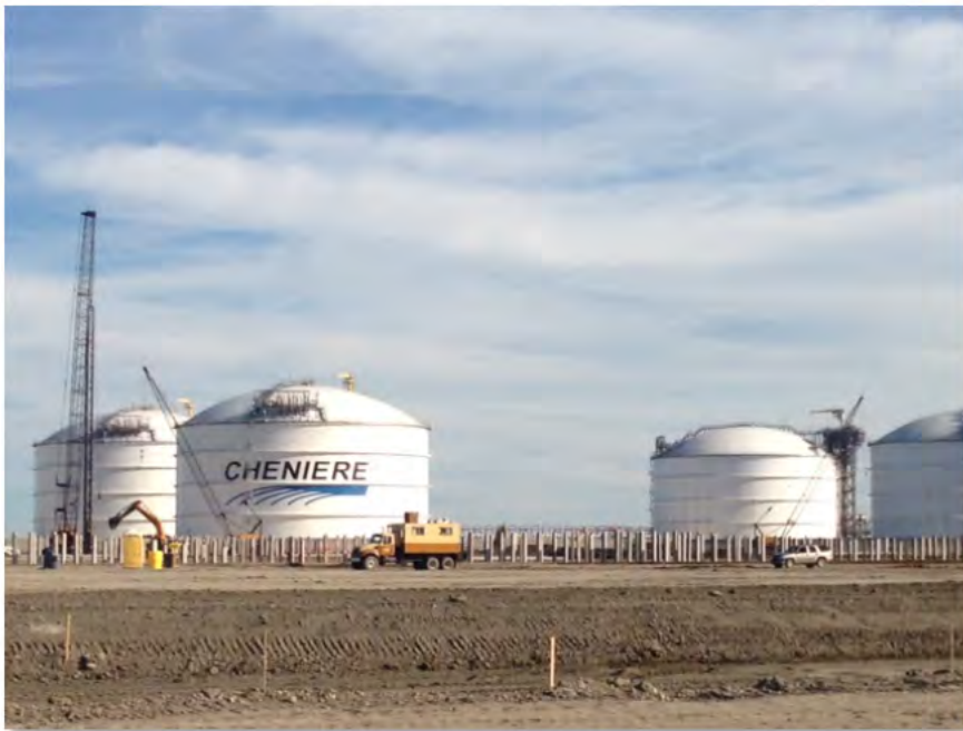
Piling Progress in Area N (21-Dec-2012)