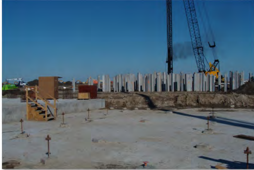
Pile Tension Connectors 131N (14-Feb-2013)