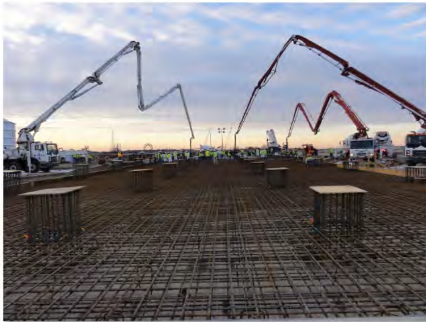
Concrete Pour 131N (14-Feb-2013)