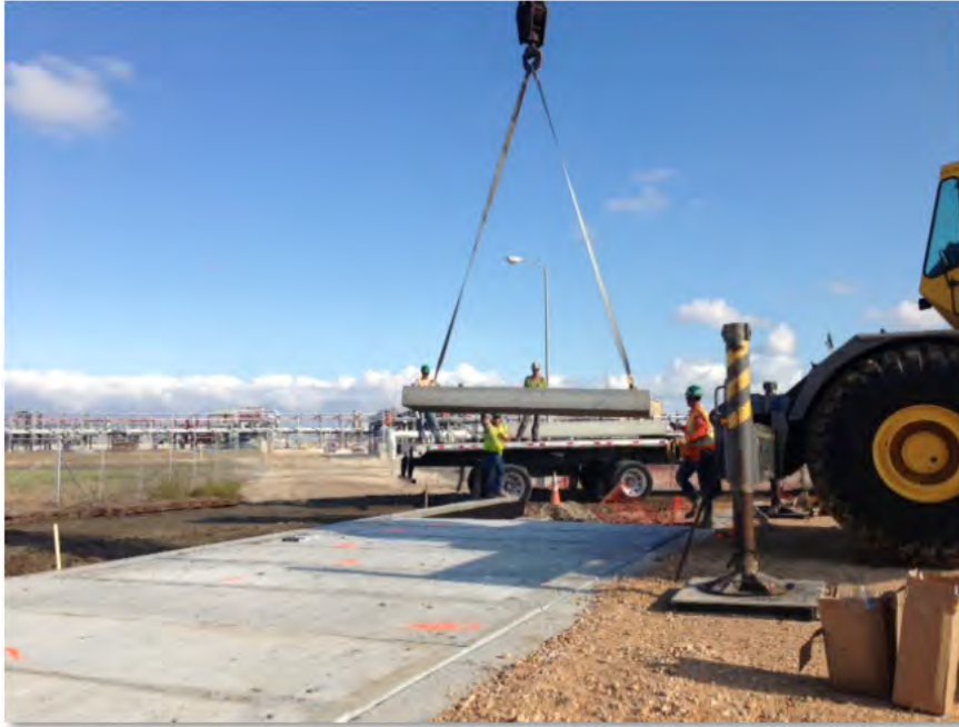
Pipeline Crossing Bridge Panel Installation (05-Dec-2012)