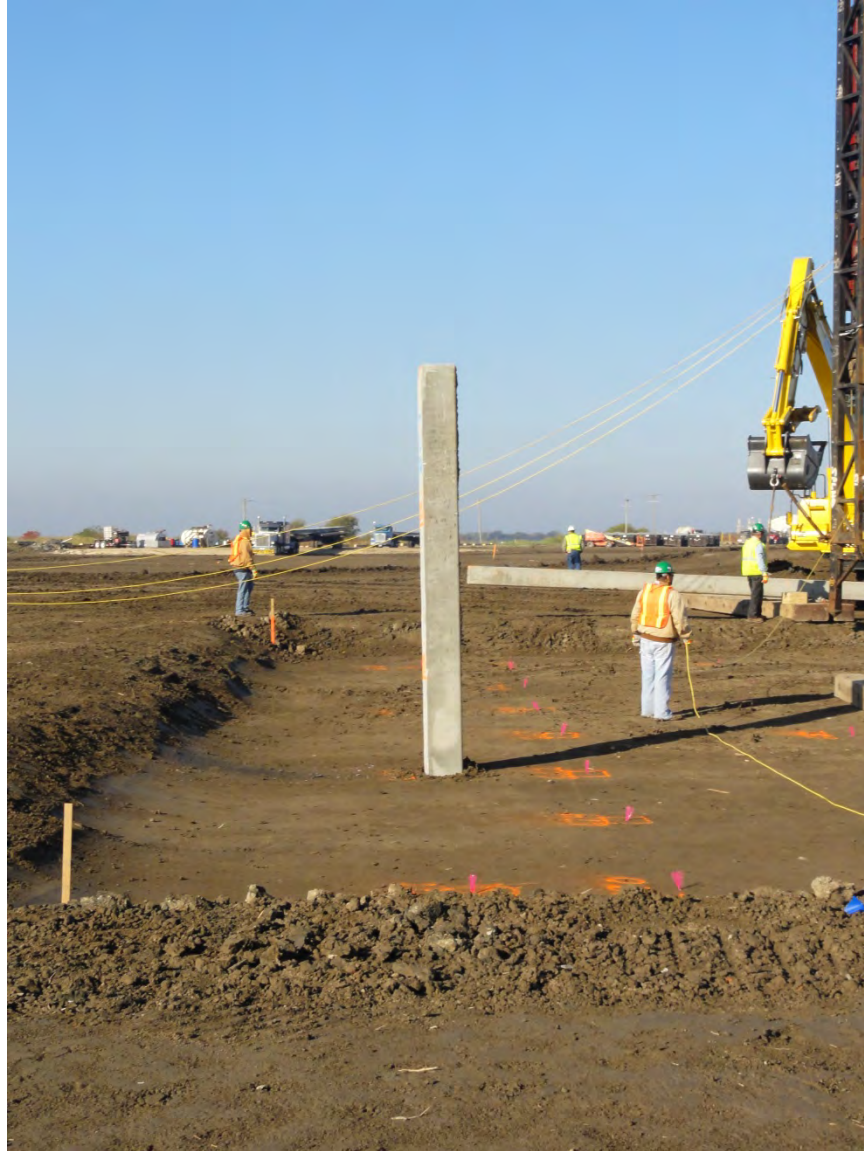
First Pile (28-Nov-2012)