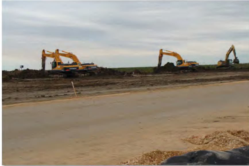
Road Work and Soil Mixing, Recon (14-Feb-2013)