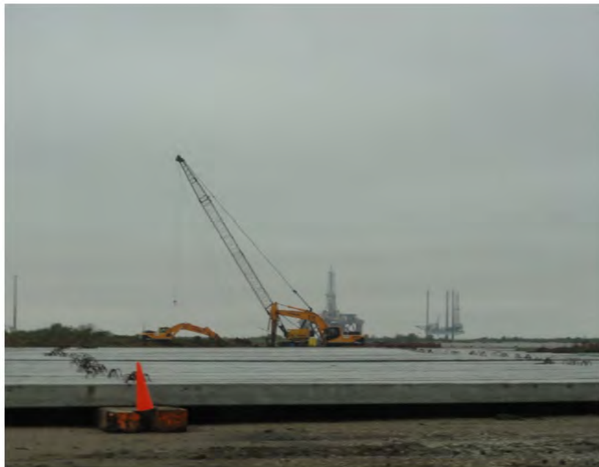
Pile Laydown near the Construction Dock (27-Nov-2012)