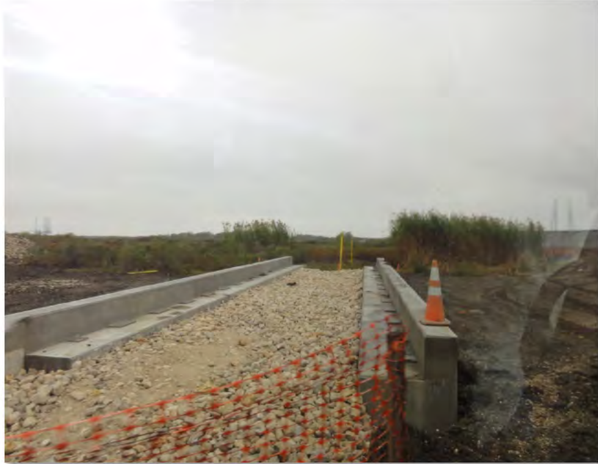
Pipe Bridge ready for Top Panels (27-Nov-2012)