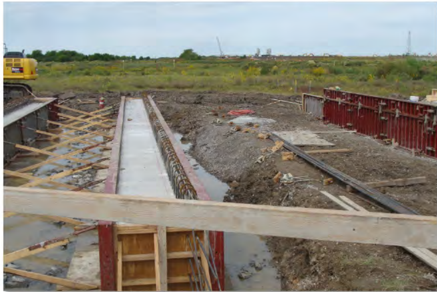
Heavy Haul Road Pipeline Bridge Crossing (18-Oct-2012)