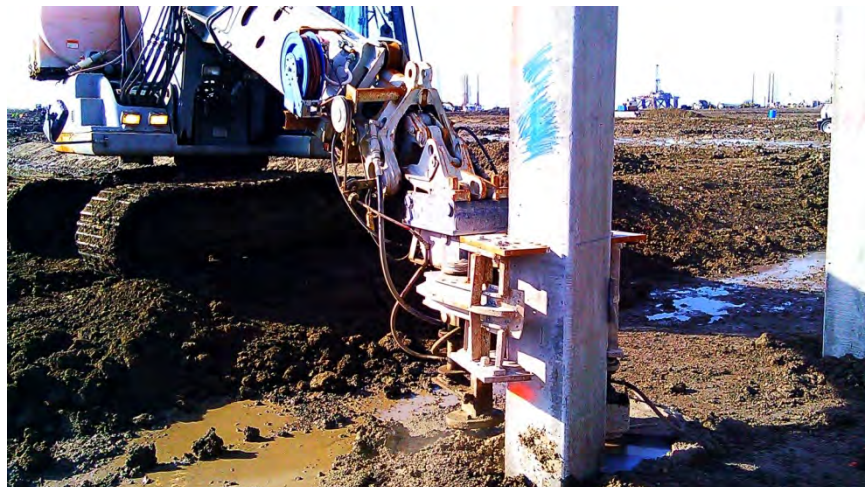
Pile Cutting in Area 131N (14-Jan-2013)