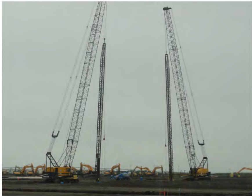
Train 2 Soil Mixing (27-Nov-2012)