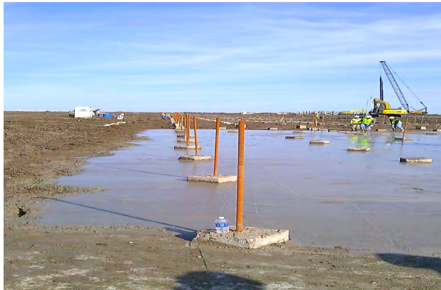
Pile Tension Connectors in Area 131N (14-Jan-2013)