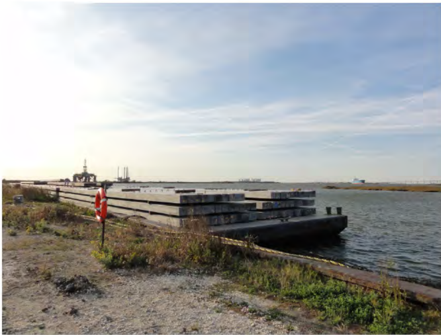
Piles Arriving by Barge (10-Dec-2012)