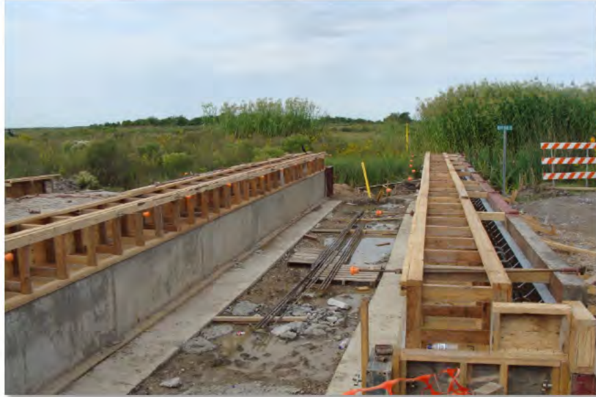
Heavy Haul Road Pipeline Bridge Crossing (18-Oct-2012)