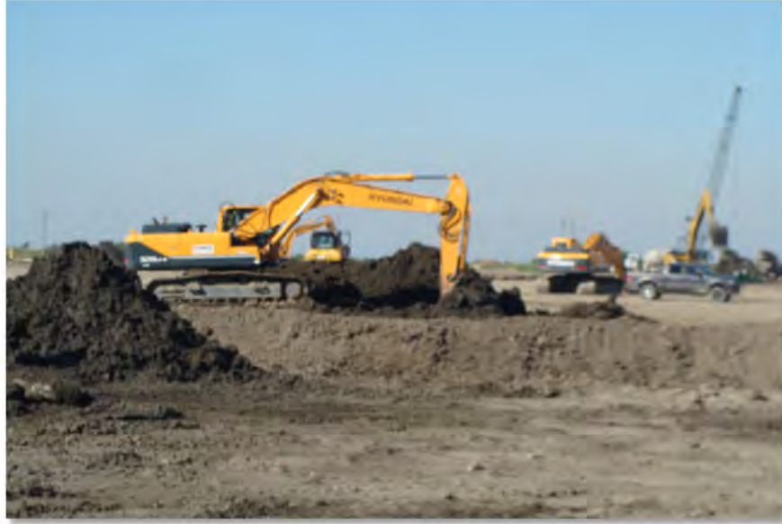
Recon Excavators Improving Soil (30-Oct-2012)