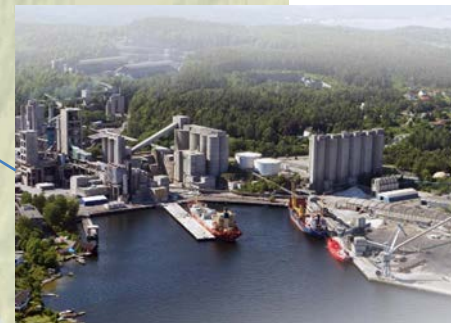
Norcem Cement production