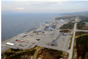
Smeaheia offshore storage