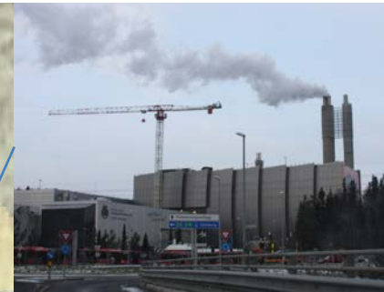
Oslo municipality Household waste incineration