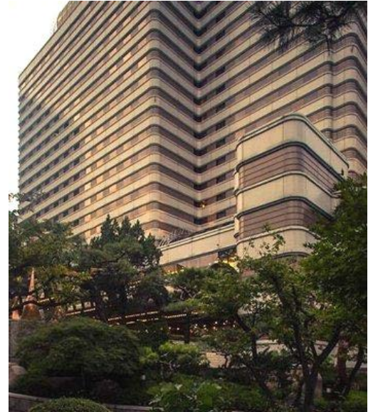
Renaissance Seoul Hotel

http://www.marriott.com/hotels/travel/selrn-renaissance-seoul-hotel/