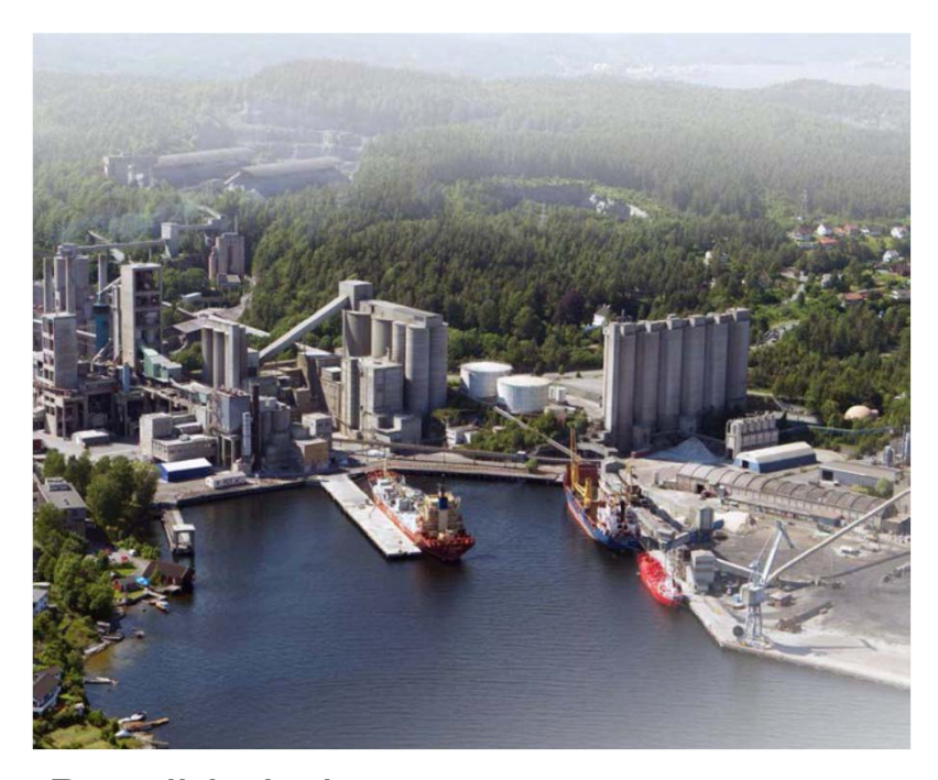
Possible industry sources to capture (Picture: Norcem, Brevik Cement production)