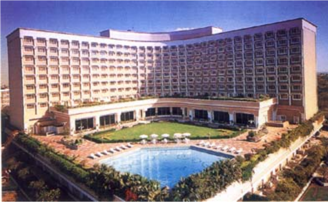
Taj Palace Hotel, Delhi, India, site of the meeting of the CSLF Policy and Technical Groups