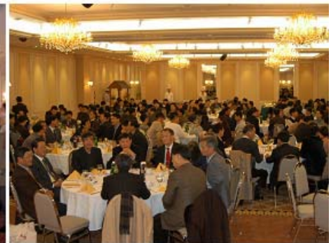
④ 2월 9일 자리를 가득 메운 만찬장의 모습