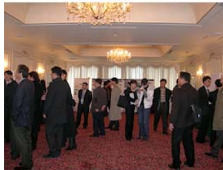
④ 포스터 발표장