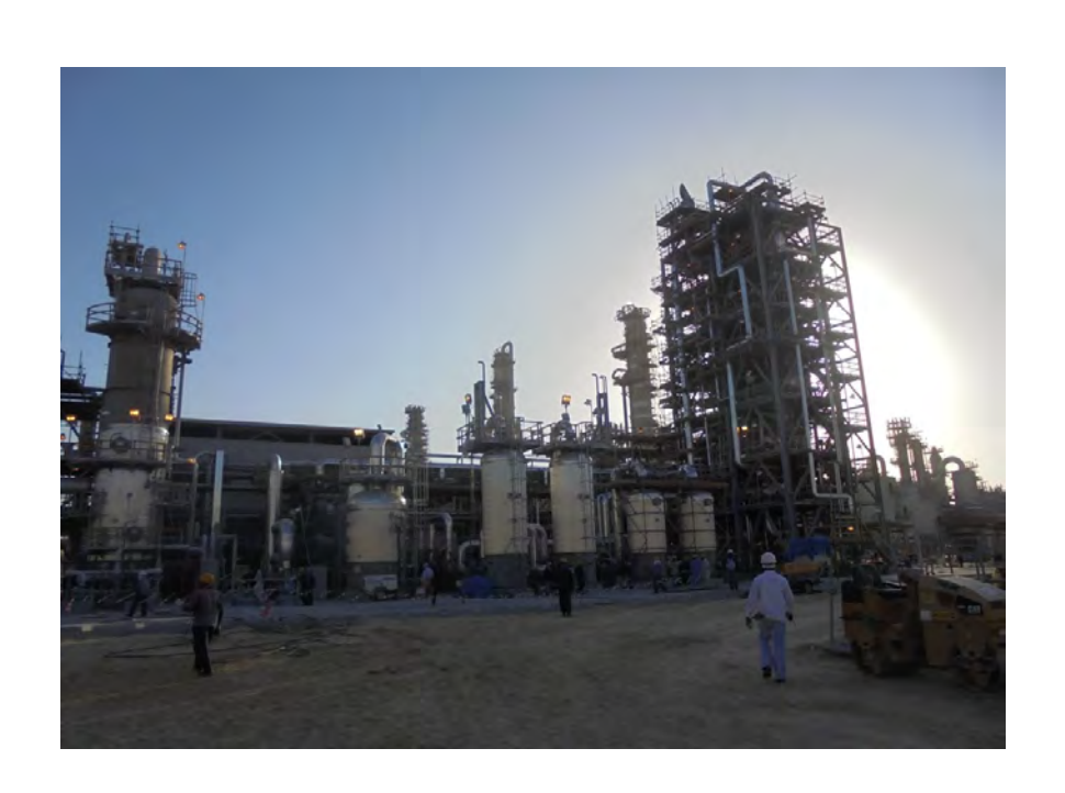
Photo of CO_2 capture and purification plant at SABIC's affiliate, UNITED, located in Jubail industrial city. courtesy of SABIC as presented at CSLF Ministerial meeting, November 2015.

Only Non-EHR CO<sub>2</sub> Utilization Project Recognized by CSLF.