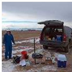
January 2010 sampling