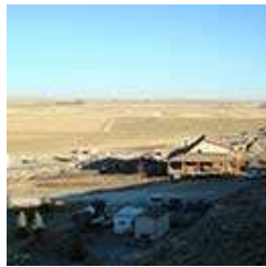
Pavillion, Wyoming landscape

Click on a thumbnail below to view the full size image.