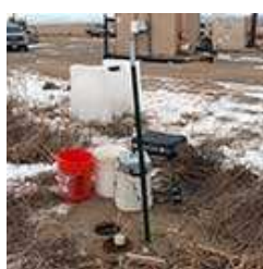
January 2010 sampling