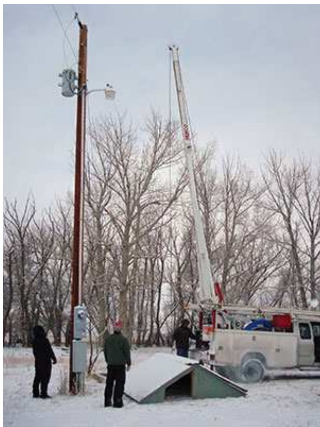
January 2010 sampling

In March 2009 EPA sampled 39 individual wells (37 residential wells and two municipal wells). The purpose of this sampling was to collect data to assess groundwater conditions and evaluate potential threats to human health and the environment. EPA conducted additional sampling in Pavillion in January 2010. This effort included sampling 21 domestic wells within the area of concern, two municipal wells, and sediment and water from a nearby creek. EPA has also sampled groundwater and soil from pit remediation sites, produced water, and condensate from five production wells operated by the primary natural gas operator in the area. EPA installed two monitoring wells in the Pavillion area in 2010. Data collected from these wells will build upon prior sampling events and help us further assess groundwater hydrology and contamination in the aquifer. EPA released the latest data from domestic and monitoring wells at a public meeting on November 9, 2011.