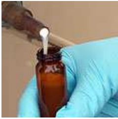
Collecting January 2010 samples