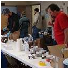
Preparing January 2010 samples